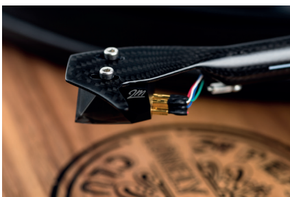
High quality cartridge Ortofon 2M Silver: Precise tracking

heavy, non-resonant materials in a precisely balanced sandwich configuration. A vinyl layer acts as the perfect turntable mat. A screwable and light-weight record clamp eliminates unwanted record vibration and rumbling of the main platter bearing. The audio performance of the final product benefits from the resonance-free platter, avoiding the ringing effect of common metal and glass platters. The 2Xperience SB is not only equipped with a highend tonearm, but comes with a pre-fitted Ortofon 2M Silver magnetic cartridge that makes use of silver voice coils. An acrylic dust cover is also included. For all fans of the Beatles who want to hear their beloved records of the Fab Four in an audiophile way! A real collector's dream!