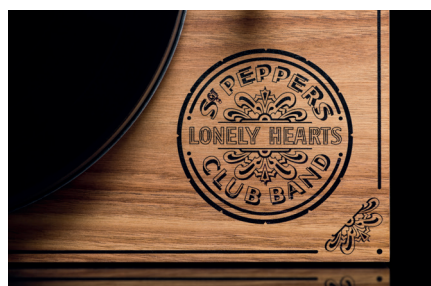
MDF plinth, acrylic platter, special artwork: Optimized resonance sensitivity