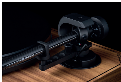
Audiophile 9"CC Evo Carbon tonearm