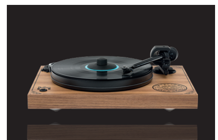
Special decoupling feet