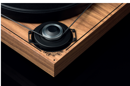
Diamond-cut aluminum drive pulley: precise power transmission