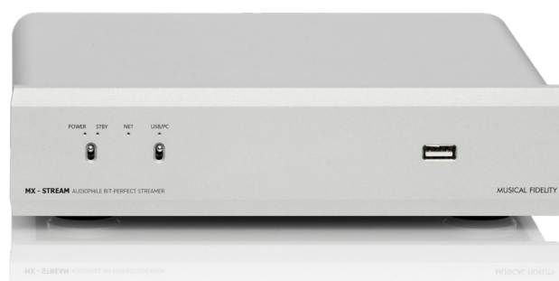
Perfect Companion: MX-Stream with MX-DAC