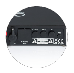
Protected Audio connections suitable for damp areas