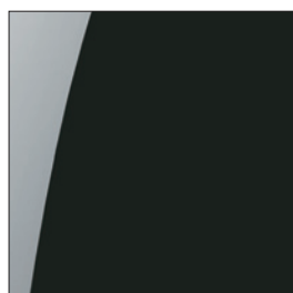
Black High Gloss