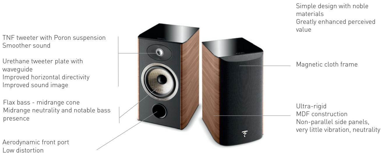
Aria 906 Walnut

The Aria 906 bookshelf loudspeaker is faithful to the DNA of the Aria range: refined high-end acoustics combined with excellent perceived value thanks to the use of noble materials. This 2-way loudspeaker allows users to enjoy all the qualities of the Flax cone: neutrality, presence and finesse. The Aria 906 is recommended for rooms measuring from 160ft 2 (15m 2 ) and from a listening distance of 8ft (2.5m).