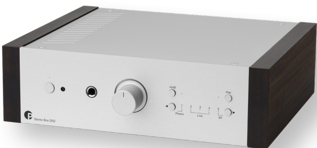
silver with eucalyptus wood side panels