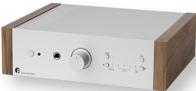
silver with walnut wood side panels