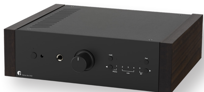
black with eucalyptus wood side panels